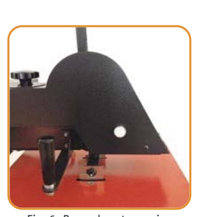
Fig. 6 · Pre and post-pressing button

The digital temperature control includes both audio and clear visual signals to indicate release time – making your work even easier.