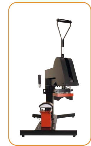
Fig. 1 · Optional cap set