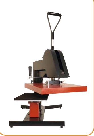
Fig. 4 · Support plate for girlie t-shirts, lengthwise