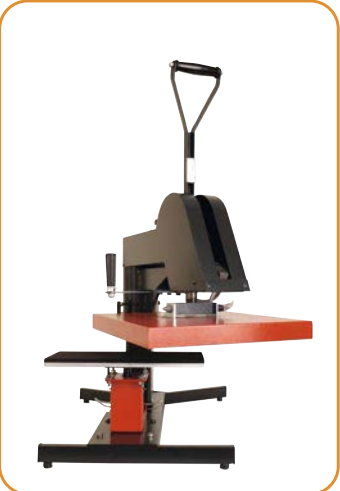
Fig. 3 · Support plate for sleeves or trouser legs crosswise