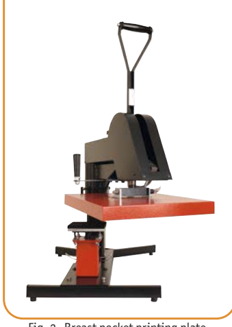
Fig. 2 · Breast pocket printing plate