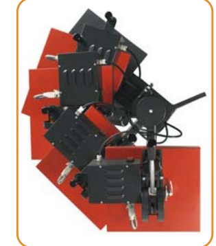
Fig. 5 Wide swivel range for easy positioning of textile