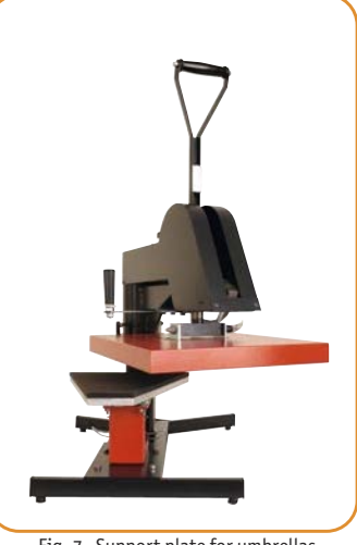
Fig. 7 · Support plate for umbrellas