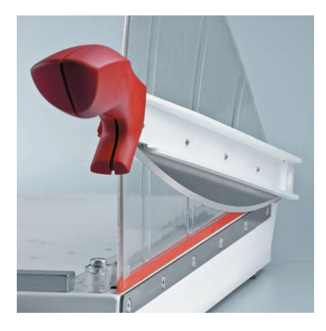
CUTTING LINE INDICATION

The cutting line indicator, which is integrated into the clamp bar, allows precise aligning of the paper to be cut.