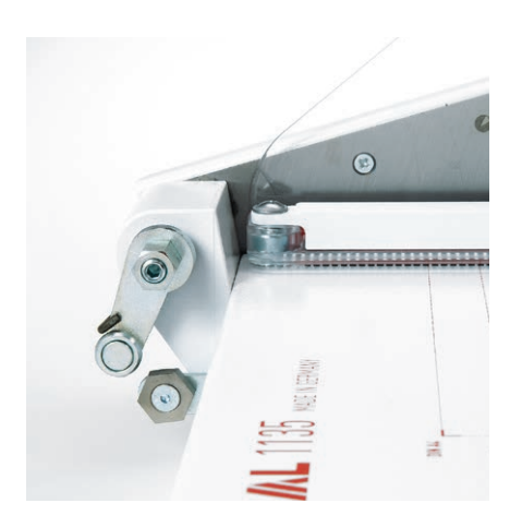
SOLID BLADE MOUNTING BRACKET The sturdy blade mounting bracket guarantees highly accurate rectangular cuts.

For efficient and easy cutting: Standard paper sizes from A6 to A4, American "letter size" and various angle indications printed on the table.