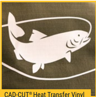
CAD-CUT® Heat Transfer Vinyl

From traditional heat transfers to dimensional emblems, heat from the upper and lower platens give you the flexibility to decorate hats with any decoration method.