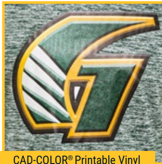
CAD-COLOR® Printable Vinyl