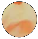
2004 golden yellow